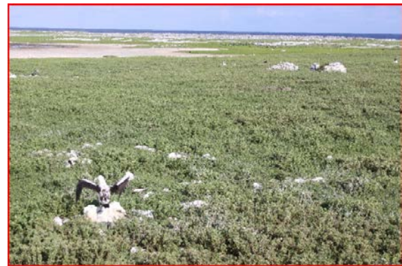
Example of vegetation changes revealed by photopoints taken June 2008 (left) and December 2009 (right) at McKean Island (Phoenix Islands World Heritage Site, Republic of Kiribati).